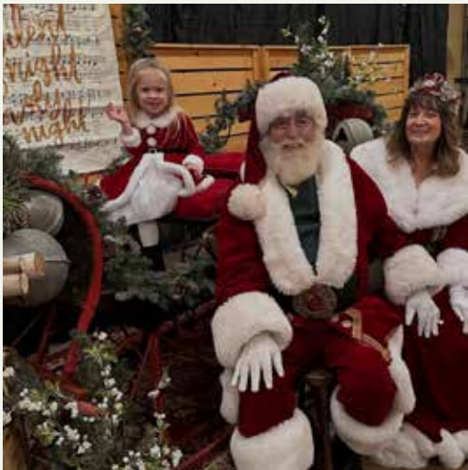
Santa appeared at Ugly Dog Distillery in Chelsea to collect gifts for the St. Louis Center residents.

Because of your support, the residents of St. Louis Center can continue to lead healthy, meaningful, and fulfilling lives. We are deeply thankful for your belief in our people-centered mission, and for helping us provide the highest level of care to individuals with intellectual and developmental disabilities.