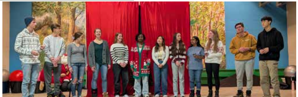
Good News A Cappella on the St. Louis Center stage.

Music also played a special role in this season of celebration. On December 10th , Good News A Cappella , a Christian a cappella group from the University of Michigan, visited the Center to share the joy of Christmas through song. Performing traditional carols and inviting residents to sing along, the group created a shared experience filled with laughter and warmth.