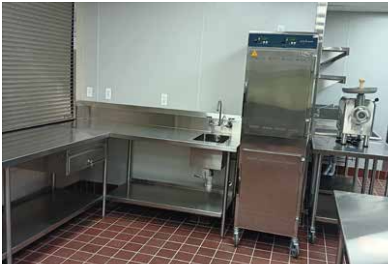
Holding and sewing