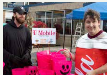
T-Mobile distributed treat buckets to 300 people.

The residents of St. Louis Center look forward to a spooky night every October.