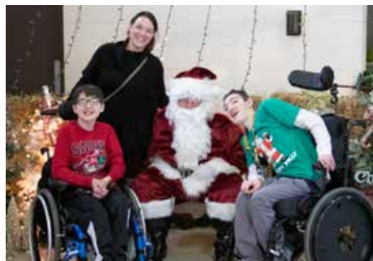
Community members had the opportunity to visit with Santa and spend time with the residents.

Santa made a grand entrance, creating a buzz of excitement. The