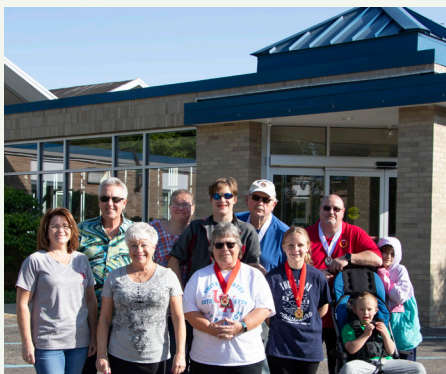
St. Louis Guanella Caravan at the Center.

While countless organizations lend their support, the Alhambra, St. Louis Guanella Caravan has carved out a reputation for its unparalleled dedication. This year they hosted a BBQ on May 25th complete with a Kona Ice truck.