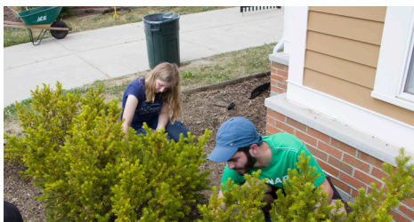
Youth worked cheerfully despite the heat.

Our Savior Lutheran Church in Chelsea hosts a mission camp each summer for youth attendees of the congregation. This year instead of traveling out-of-state the organizers decided to concentrate on outreach at home June 19th-22nd. For a whole week students spent the day doing good works. Their afternoons were spent at St. Louis Center helping with some landscaping projects around resident homes in the Village.