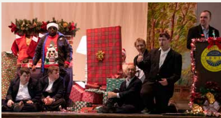
The guys of St. Joseph Hall delivered gifts for the "Twelve Days of Christmas."

Christmas tunes throughout the night as the stage was set for the skits performed. Skits included a play from the gentlemen at St. Joe's Hall and numerous readings from other residents. Each house was dressed in a theme that matched their skit. Standing out, of course, was the K of C House all dressed as the "Grinch" as a DCW read from the Dr. Seuss book, "How the Grinch Stole Christmas".