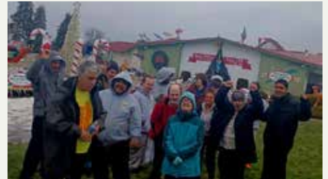
Center residents had fun browsing at Bronner's.

CHRISTMAS IS A SEASON TO SPEND TIME WITH FAMILY SHARING LAUGHTER AND JOY.