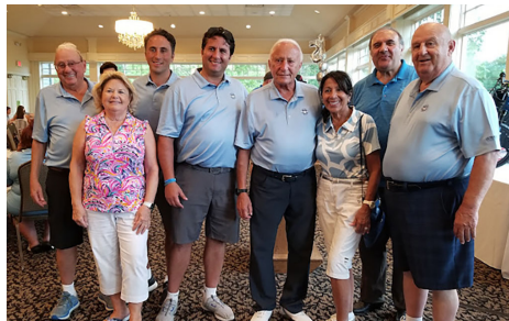
The Outing founders and their families are proud to assist St. Louis Center.