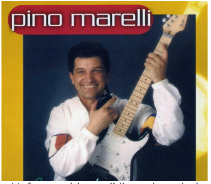
Unforgettable, mulitlingual musical entertainment.