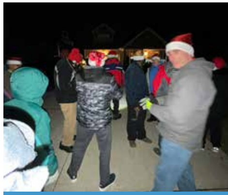
Residents enjoyed caroling in a nearby Chelsea neighborhood.

that included a visit from Santa, a hot chocolate bar, a visit from the Chelsea Fire Department, and Chelsea Police.