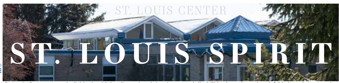
St. Louis Center serves individuals with intellectual and developmental disabilities in an intentional, faith-based community.