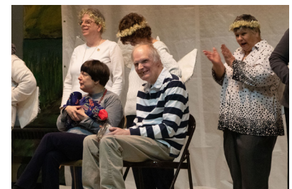
In 2019 family and friends enjoyed the songs of choirs of angels.

The SLC staff has a tradition of helping the residents prepare songs and sketches on holiday themes that are presented at the annual Christmas Program. The event will take place this year in the SLC gym on Sunday, December 12th at 5:30pm. A time of food and fellowship will follow the program.