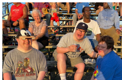
Residents of St. Joseph Hall had a great time watching the Demolition Derby.

Several of the St. Louis Center residents went to the Chelsea Fair with staff members on Wednesday, August 18th. They purchased dinner from the fair concession stands and ate under the pavillion. They were also able to enjoy the Demolition Derby.