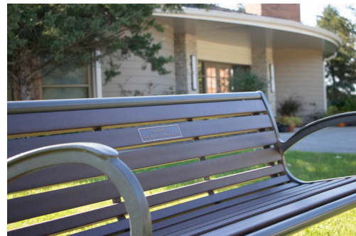
The Argiero Family bench outside of Fr. Guanella Hall for Assisted Living.