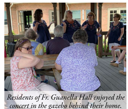
Residents of Fr. Guanella Hall enjoyed the concert in the gazebo behind their home.