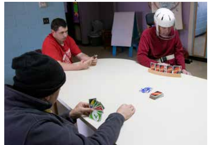
Residents play a quick game of Uno before delivering Meals on Wheels.

The Day Program staff offers participants many choices for activities throughout the day. Many residents enjoy going to deliver Meals on Wheels. Other activities they like include puzzle books, coloring, making crafts, playing cards and exploring the country by looking at the United States map and picking a place to research and learn about. It is especially rewarding to see the residents keeping themselves occupied while staff is able to step back and watch them thrive.