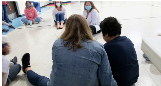
Social Services staff reading to the children during 'school.'

With this time in quarantine, we have been providing opportunities to keep our resident's minds and bodies active. As an Occupational Therapy student, I have an interest in everyday activities that provide meaning to lives, as well as, work on different performance skills.