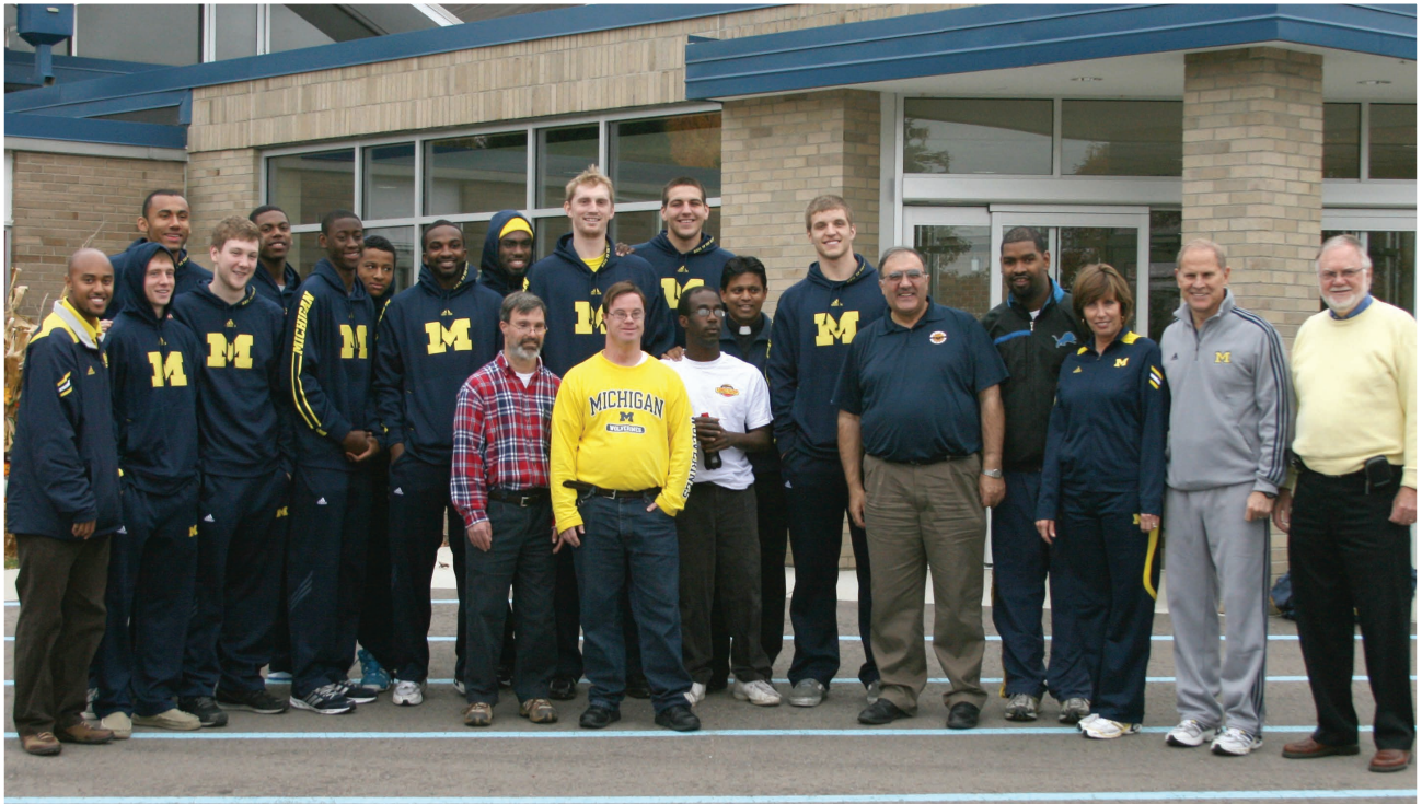
University of Michigan Basketball Team Visit – October 26, 2012