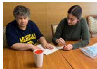
Personal care during Covid-19.

The Michigan Governor and State Senate extended the “Stay Home” order through April 30th, and it will be several weeks before things are back to normal. In the meantime, SLC will do everything it can to keep the residents safe.